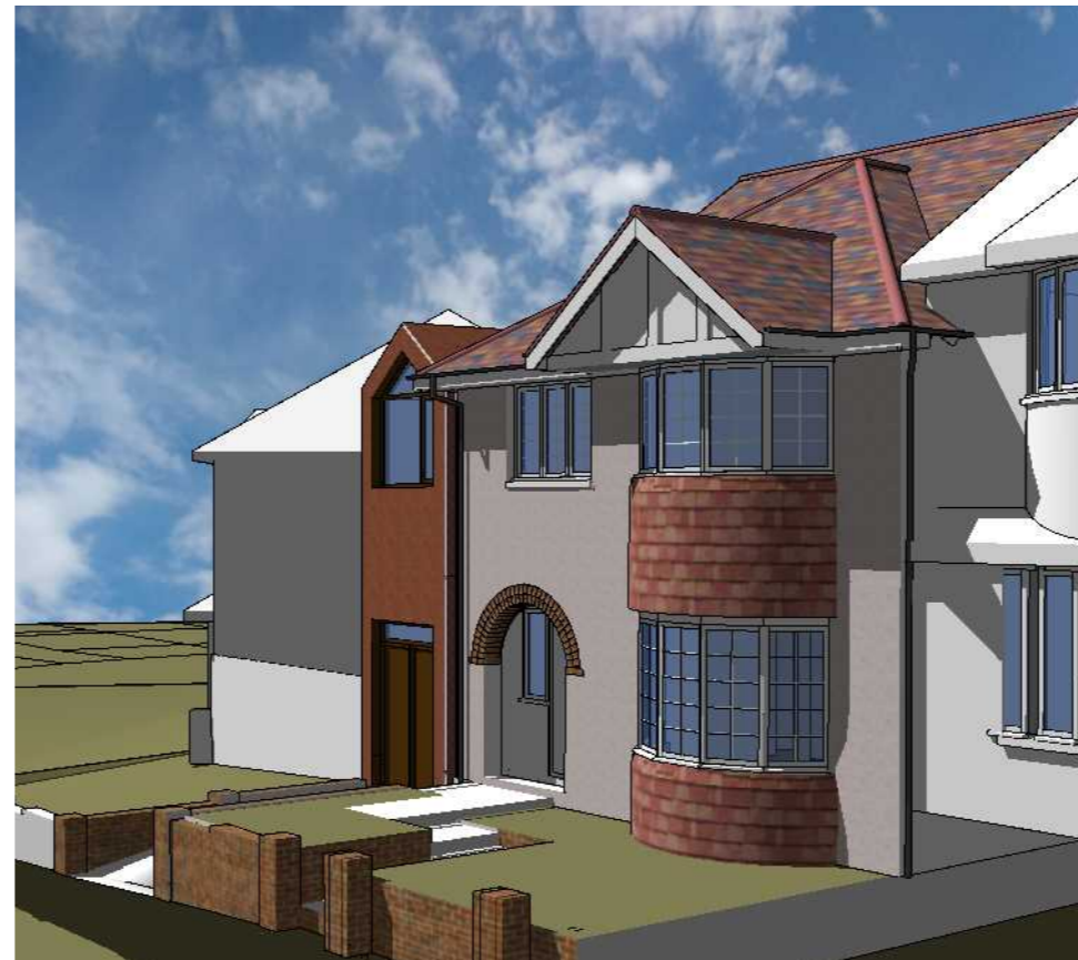
Street view 2

Double doors to allow access for large items