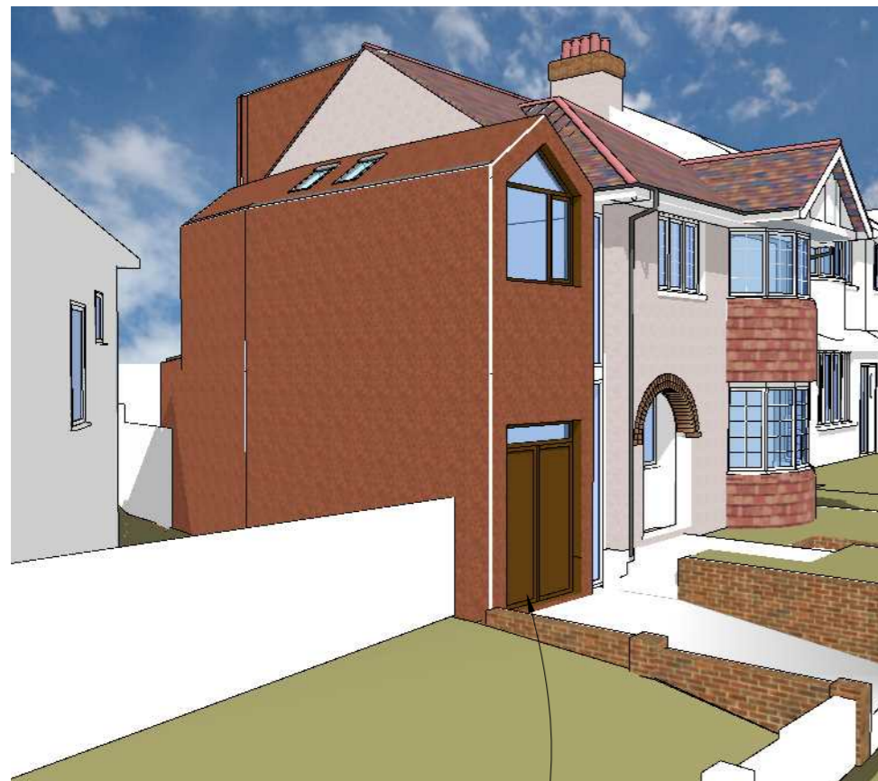
Street view 1

Garage floor level retained to maximise storage height and enable external access