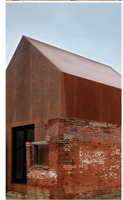
Corten weathering steel